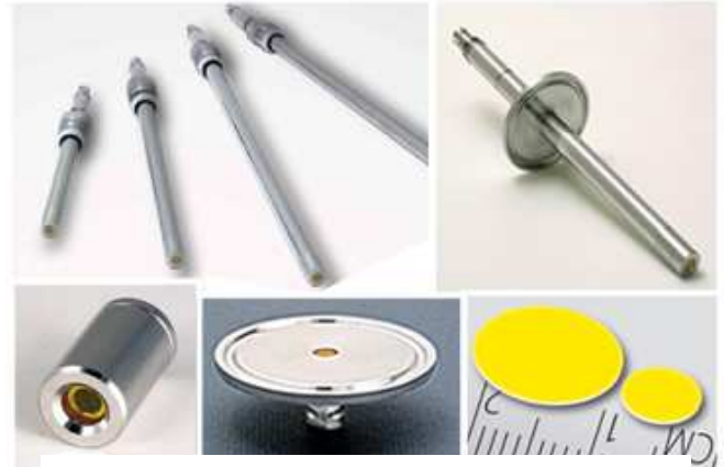
Polestar Probes and Sensors are available in a variety of formats